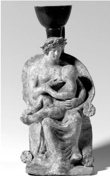
Fig. 6: Suckling kourotrophos (nymph and Dionysos?)

Att. plastic lekythos, 4th century BC, from Corinth, Berlin SMBK F 2913.