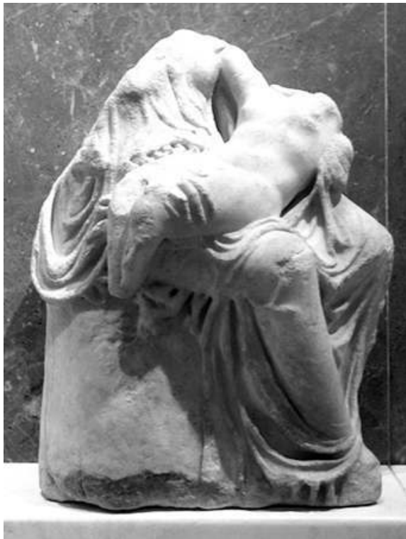
Fig. 5: Group of the Erechtheion frieze (fragment)

409–406 BC, Akropolis Museum Acr. 1075.