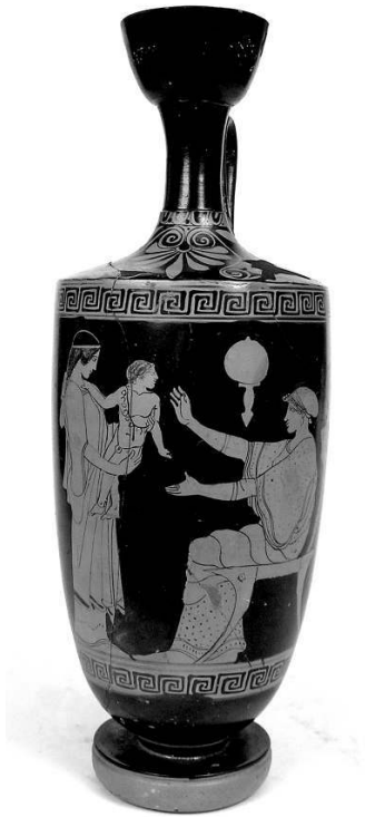
Fig. 4: Mother, nurse, and child

Att. rf. lekythos, painter of Bologna 228, 475–450 BC, Athens NM 1304. © Hellenic Ministry of Culture and Sports /Archaeological Receipts Fund. National Archaeological Museum, Athens, photo: Irini Miari.