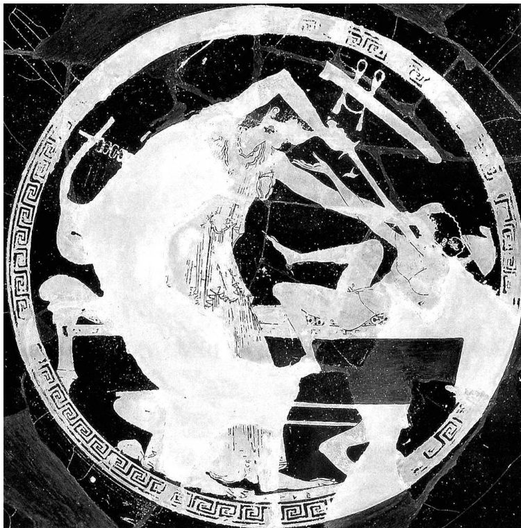
Att. rf. kylix, 510–500 BC, Magnoncourt-Painter, Munich 2638. 9191.