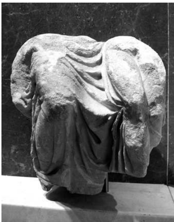
Fig. 8: group of the Erechtheion frieze (fragment)

409–406 BC, Akropolis Museum Acr. 8589.