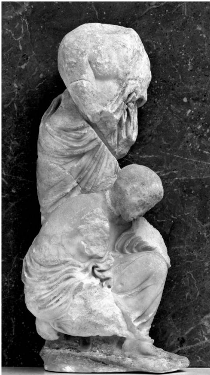
Fig. 7: group of the Erechtheion frieze (fragment)

409–406 BC, Akropolis Museum Acr. 1073.