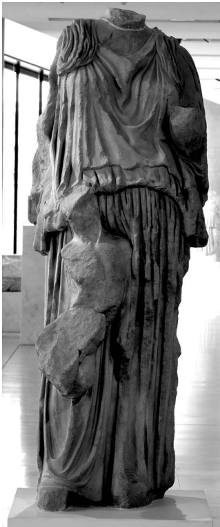
Marble by Alkamenes, 430–420 BC, Athens Akropolis Museum 1358. 2789.