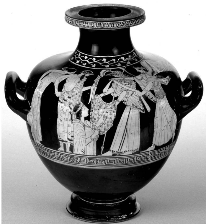
Att. rf. hydria, 470–460 BC, Oinante painter. London British Museum E182.