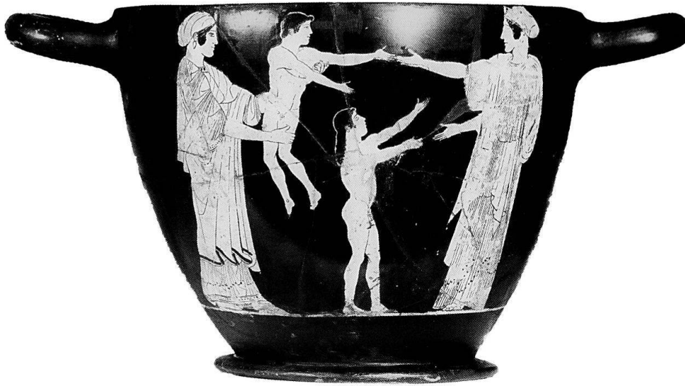
Att. rf. skyphos, around 450 BC, Vienna KHM 1773.