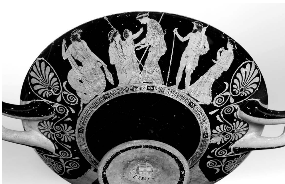
Att. rf. kylix, 440–430 BC, Berlin SMPK F 2537.